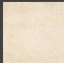
CREAM PIE* Group IV

Habitat Series GRES LAPATO 600x600 mm 600x300 mm