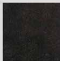
BLACK Group IV Full Body