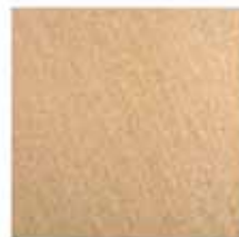
CREMA STONE Group IV+ Full Body