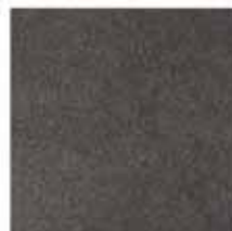
Noce Group IV+ Full Body