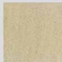
SANDBLAST Group IV