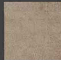
DUKE GREY* Group IV