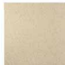
STONE IVORY Group IV+

Latina Series GRES LAPATO 600x600 mm 600x300 mm