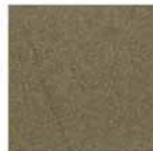
ANCONA Group IV