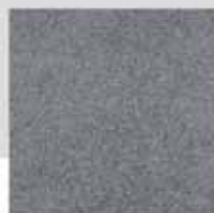
Grey Group IV+ Full Body