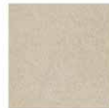
ASCOLI Group IV+