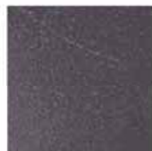
MARRON Group IV+ Full Body