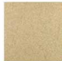
AREZZO Group IV+