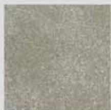
AURA GRIS Group IV