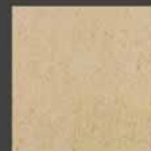
SAHARA Group IV