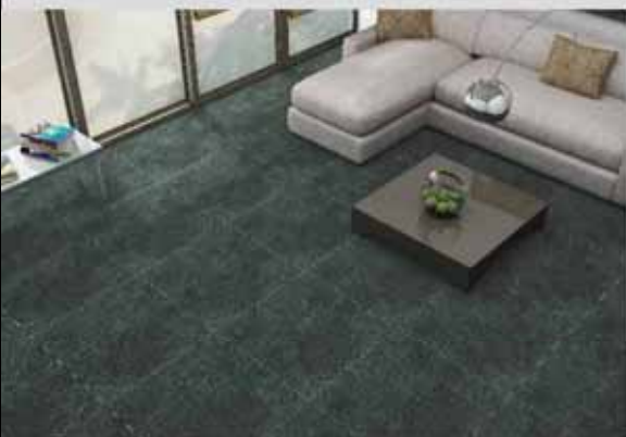
IMPERIAL SERIES | Rustico Series GRES MATT 600x600 mm