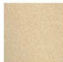
STONE BEIGE Group IV+