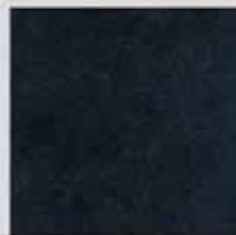
Black Group IV+ Full Body