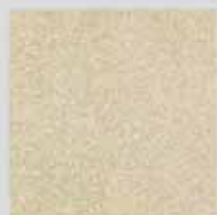
EVEREST Group IV