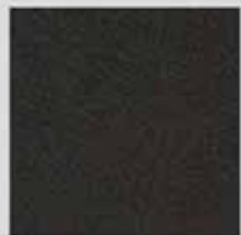
BLACK Group IV Full Body