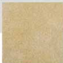
SIERRA Group IV