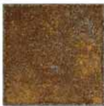
FUTURA GOLD Group IV