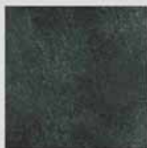
NEPTUNE Group IV Full Body