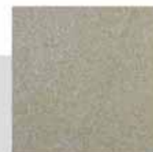
AVELLINO Group IV+ Full Body