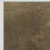
MOUNTAIN GREY* Group IV