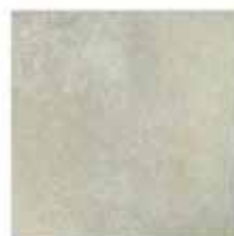
AZURE Group IV