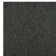
STONE ASH Group IV Full Body