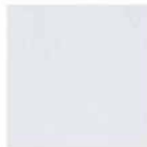
ARGENTINE WHITE Group IV