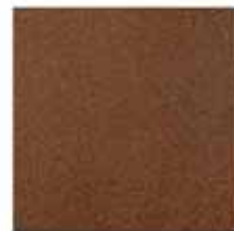
STONE BROWN Group IV Full Body