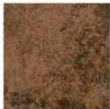
FUTURA BROWN Group IV