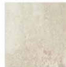
WHITE SMOKE* Group IV*

Terra Del Fuoco Series GRES MATT 600x600 mm 600x300 mm