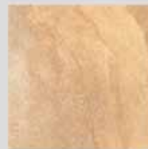
CORN SILK* Group IV*